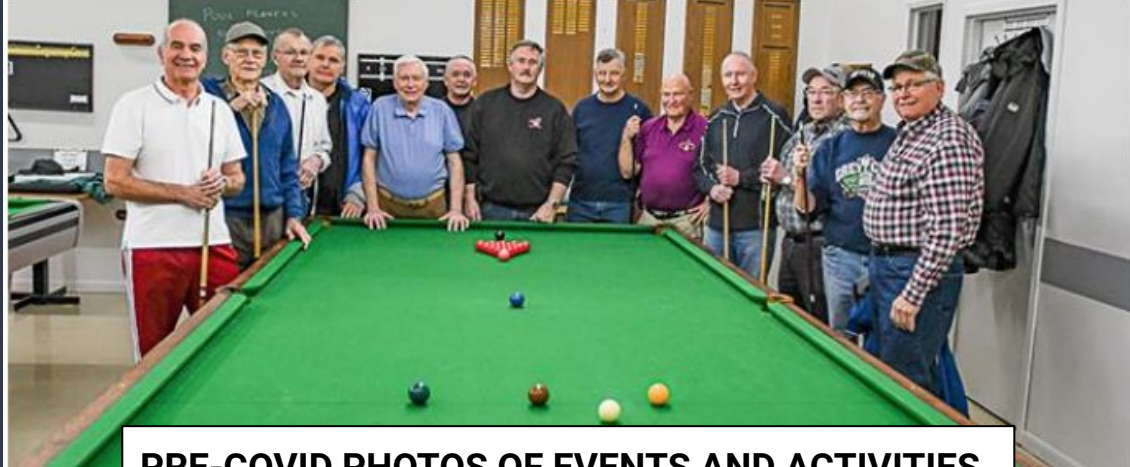
PRE-COVID PHOTOS OF EVENTS AND ACTIVITIES

All age groups are welcome to the Centre to enjoy activities, programs, meals and special events in a friendly barrier free atmosphere.